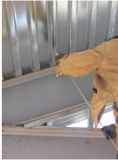
SXP Installation Ft. Bragg Construction